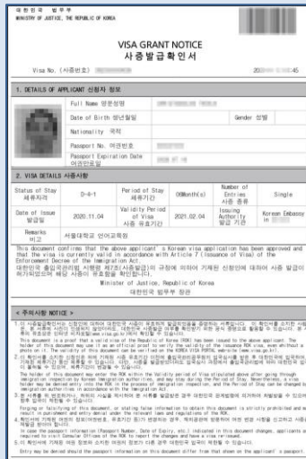
『 Visa 』

Clear copy of the personal information page