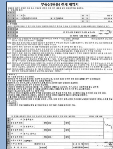
『 Proof of Residence 』

Certificate issued after your arrival in Korea